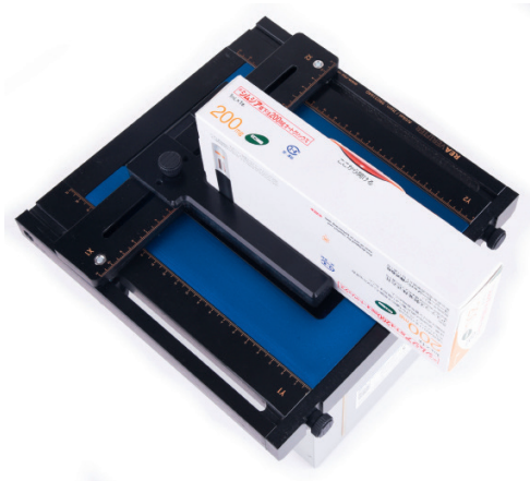
Precision positioning of the sample