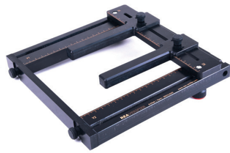
View from above: REA VeriCube Positioning Aid