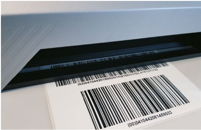
Quality verification of barcodes