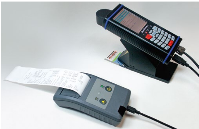
Creation of test protocols