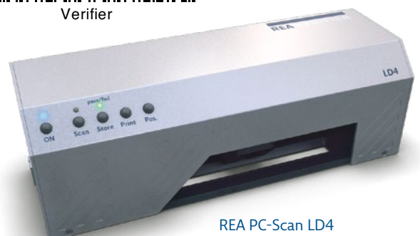
REA PC-Scan LD4 (reference device for barcodes)