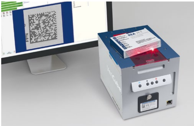
Verification of Data Matrix codes on product packaging