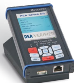
REA Check ER (compact, for barcodes, mobile)