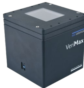
REA VeriMax (for 2D codes and barcodes, for mounting in production lines)