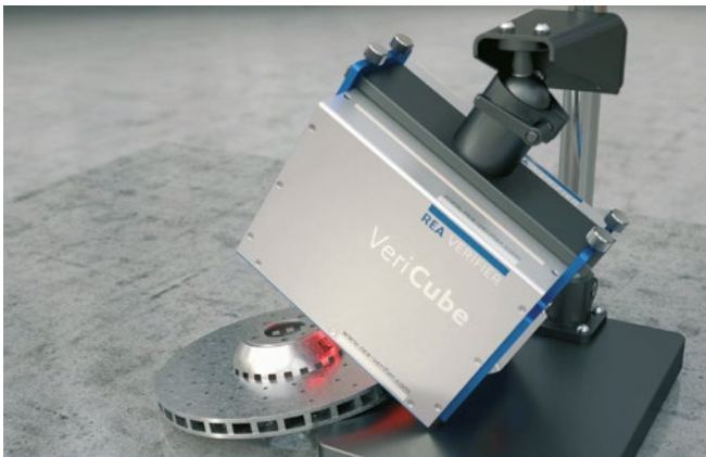
Stand solution for code verification on 3D objects