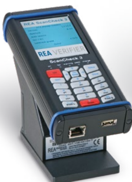
REA ScanCheck 3 (universal, for barcodes, mobile)