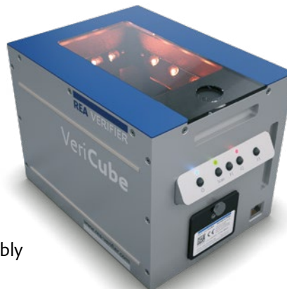
REA VeriCube (for 2D codes and barcodes, ready for 21 CFR Part 11)