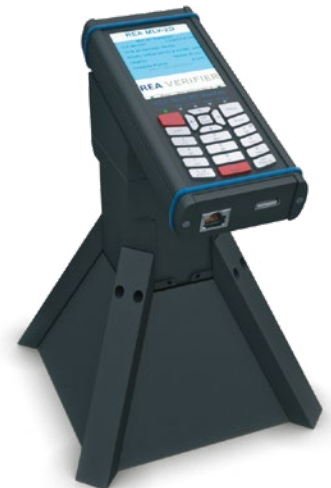
REA MLV-2D (for 2D codes and barcodes)