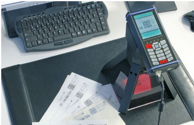
Verification of Data Matrix codes on envelopes