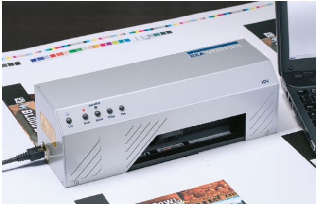
Measuring of barcodes on print sample sheets