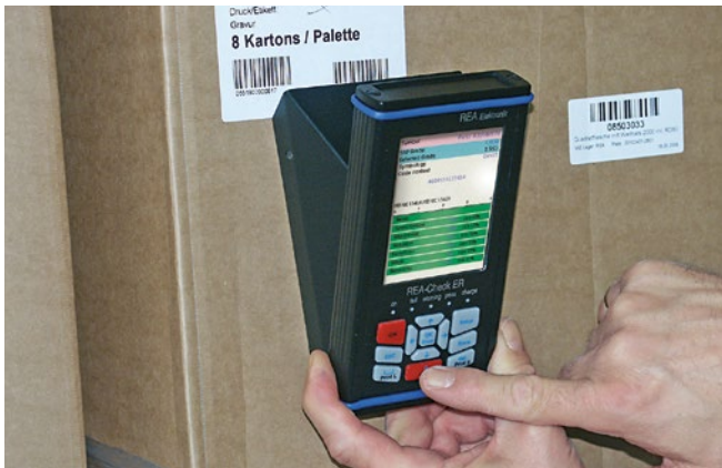
Flexible verification of barcodes on site